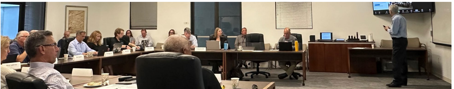
A 12-member panel of experts from across the nation meets at SCCWRP in fall 2024 to collaboratively develop the SMC's 2024-2029 Research Agenda, a forward-looking document that lays out the SMC's research priorities over a five-year period. The SMC Research Agenda serves as a guide that helps the SMC decide which research projects to prioritize and fund over the coming five years.