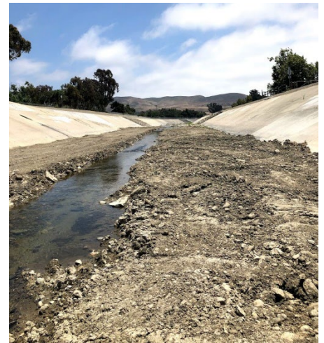
Streams that have been modified for flood control purposes, such as Arroyo Trabuco in southern Orange County, above, tend to receive uniformly lower bioassessment scores than other stream types. In recent years, the SMC has been focusing on studies intended to shed light on how applicable bioassessment science is to the diverse stream types found across southern California and beyond.

bioassessment scores can improve when water quality is improved, although this relationship can be greatly diminished in hard-bottom channels and other modified channels [ SCCWRP Technical Report #1434, #1437 ]. Meanwhile, the SMC is advancing its work on modified channels to also understand the effectiveness of potential management solutions for improving biological health. In summer 2025, the SMC launched a study examining whether water-quality or hydrological improvements alone (i.e., without channel restoration) can improve biological health, plus whether channel restoration in tandem with water-quality improvements can positively influence bioassessment scores.