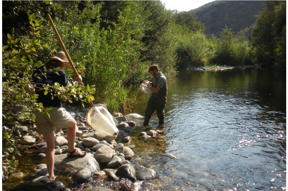
A field crew collects samples of aquatic insects and other benthic invertebrates from a southern California stream. For more than two decades, the SMC has been leading efforts across southern California to advance biology-based monitoring of watersheds – an approach that enables managers to directly measure how environmental stressors affect the health of aquatic life.

Since the SMC’s inception in 2001, the SMC has been leading efforts across southern California to advance the